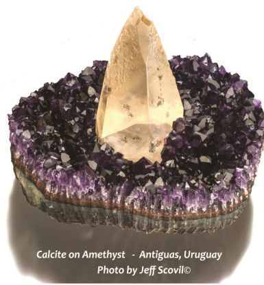
Calcite on Amethyst - Antiguas, Uruguay

FREE ADMISSION ★ FREE PARKING ★ RETAIL WHOLESALE FOR QUALIFIED BUYERS